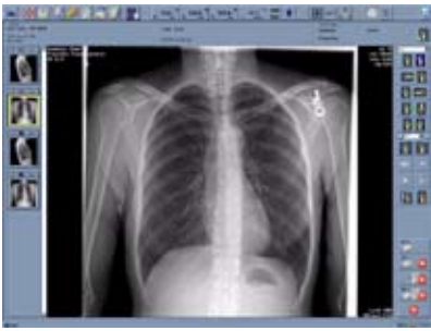
Technique selection and image shown on touch screen monitor.